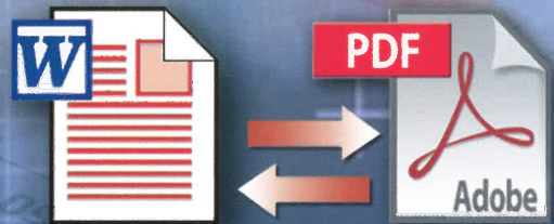
Compare Manuscripts vs. Artwork