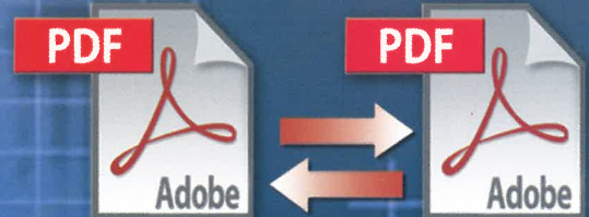
Compare Artwork vs. Artwork