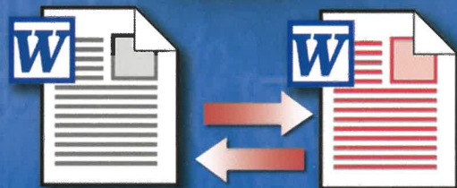
Compare Revisions of Manuscripts